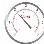
2 Kg/cm 2