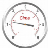
1,2 Kg/cm 2