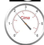
2 Kg/cm 2